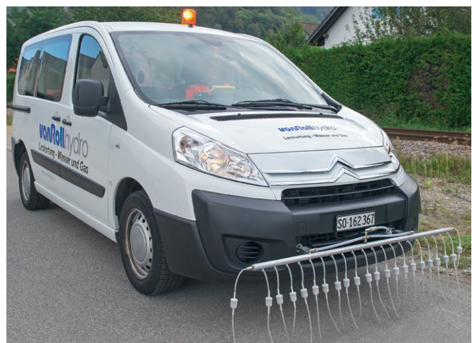
Gas detector measurement vehicle

No need for a heavy, incomprehensible manual. A short set of operating instructions is enough. With only four buttons and a six-stage menu, all functions are present.